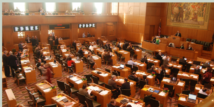
The Oregon Legislature concluded its session on June 30.